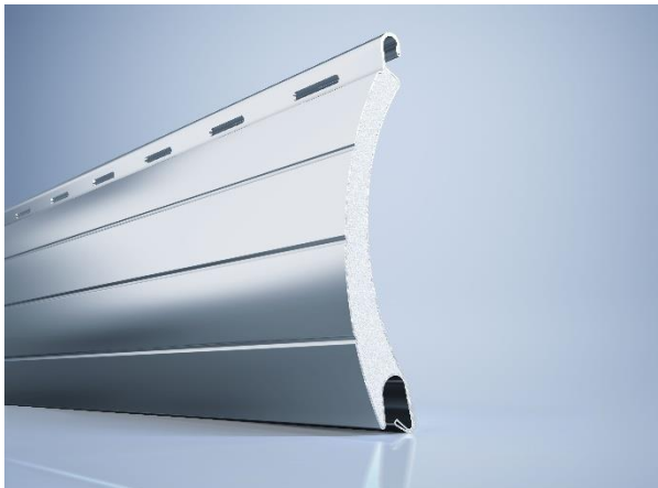
[R5270 00_web] - RS 52 SW

Thanks to the new updates for heroal roller shutter systems, heroal offers a forward-looking portfolio that supports efficient planning and manufacturing processes as well as maximum design freedom.