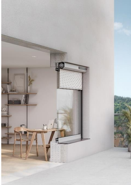
[heroal 17.1 New products VP A+B_RS 37_A5]

Thanks to the new updates for heroal roller shutter systems, heroal offers a forward-looking portfolio that supports efficient planning and manufacturing processes as well as maximum design freedom.