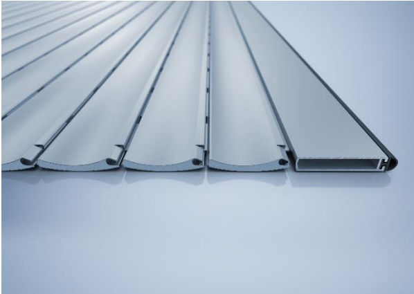
[R5280 00_web] - Finished curtain locked with RS 37 SW

For maximum flexibility, rapid availability as well as easy, time-saving manufacturing, heroal roller shutter slats are available as prefabricated finished roller shutter curtains comprised of a slat system and end slat.