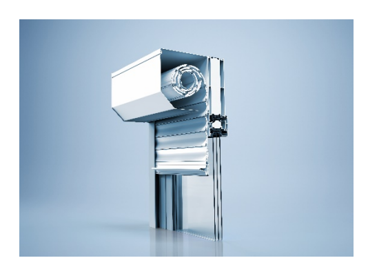
[heroal Ready RS 52 Vorbaurollladen]

More slat variants for customised heroal Ready finished elements for surface-mounted roller shutter systems now available: the roller shutter slats heroal RS 38 and heroal RS 42 and the security roller shutter slat heroal RS 55 SL (see illustration) have been added.