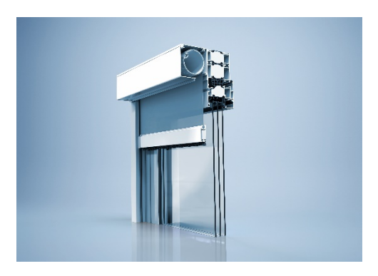
[heroal Ready VS Z Sonnenschutzsysteme]

The insulation box system heroal Ready RS 52 IB Unique, with the variants inside inspection (see illustration) and outside inspection, has been extended with numerous additional options: among them is the increased element width of 4,500 mm and the operation via emergency hand-crank.